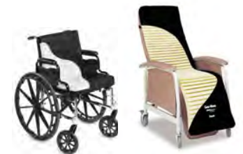
Short Wave® Seat and Back Cushion

Seat/Back Combination Products for Prevention with Positioning LOW to MODERATE risk