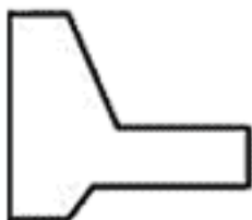
Eccentric Luer Slip Tip

A friction-fit connection that requires the clinician to insert the tip of the syringe into the needle hub or other attaching device in a push-and-twist manner. This will ensure a connection that is less likely to detach. Simply sliding the attaching device onto the syringe tip will not ensure a secure fitting.