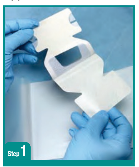
Prep the catheter site according to your facility's protocol. Let all prep solutions dry completely. Remove liner. Place dressing, adhesive side up, on sterile side of dressing package.