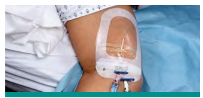
3M^{\text{TM}} Tegaderm IV Transparent Film Dressing with Border 1650 specifically designed for PICC lines, larger window accommodates catheter tubing.