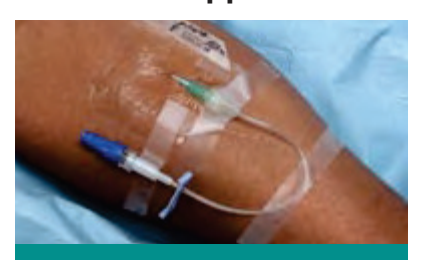
3M™ Tegaderm™ IV Transparent Film Dressing Frame Style 1624W shown on PIV.