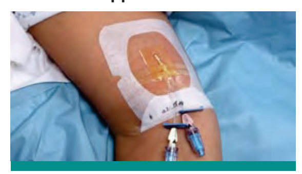
3M^{\text{™}} Tegaderm<sup>™</sup> CHG (chlorhexidine gluconate) IV Securement Dressing 1658 shown with 3M^{\text{™}} Steri-Strip<sup>™</sup> Adhesive Skin Closures on PICC.