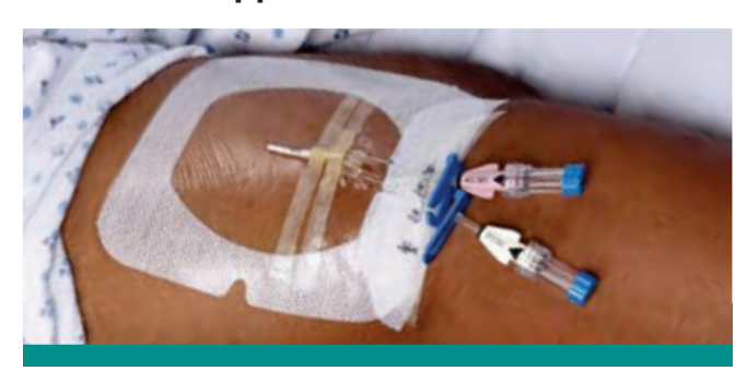
3M^{\!\top\!\!\!\!M} Tegaderm \!\!\!\!^{\mathsf{T}} Transparent Film Dressing with Border 1616 shown on PICC.