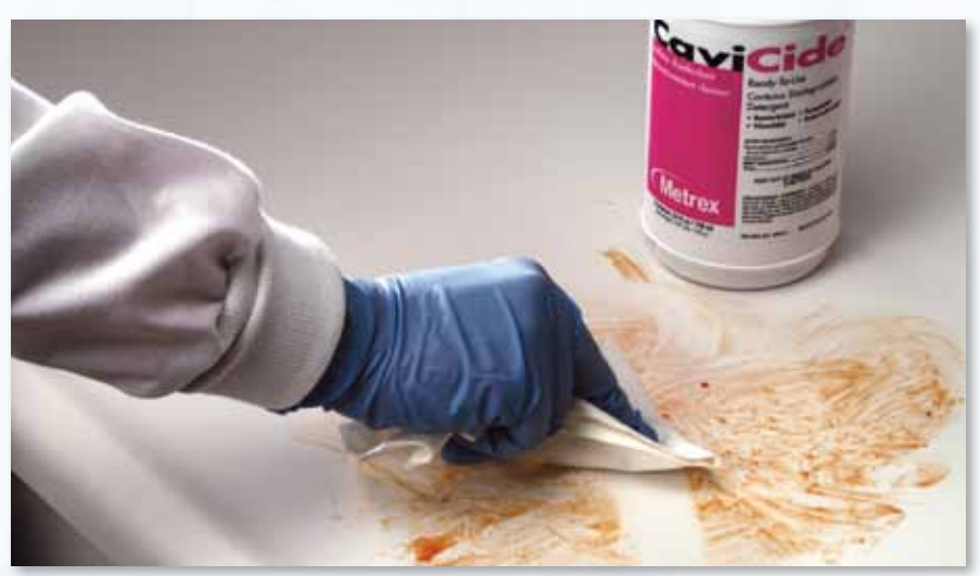
2. Wipe with clean paper towel to remove debris and bioburden.