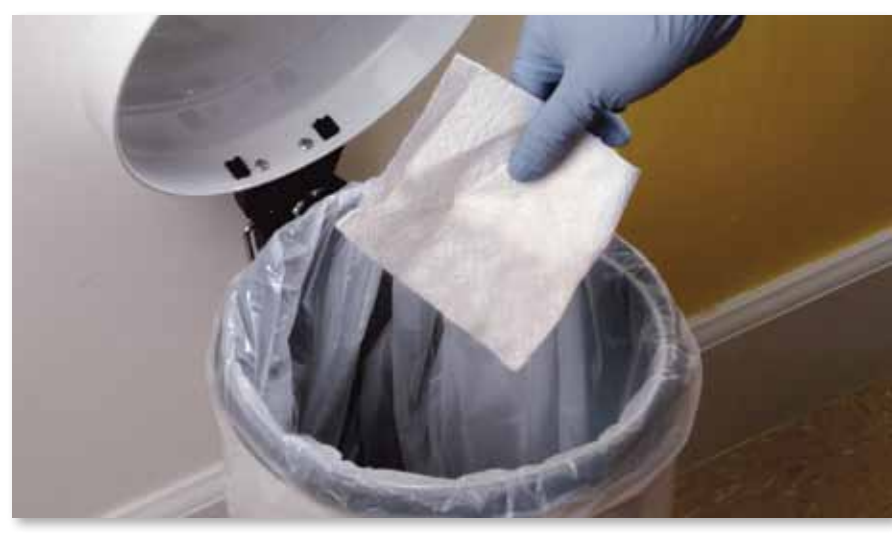
6. Discard towel.