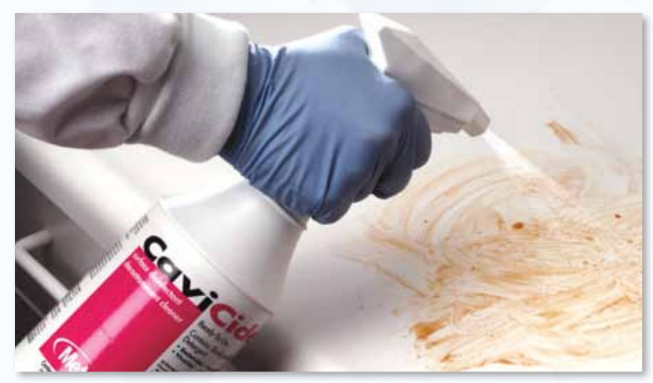
1. Spray CaviCide directly onto surface to be cleaned.