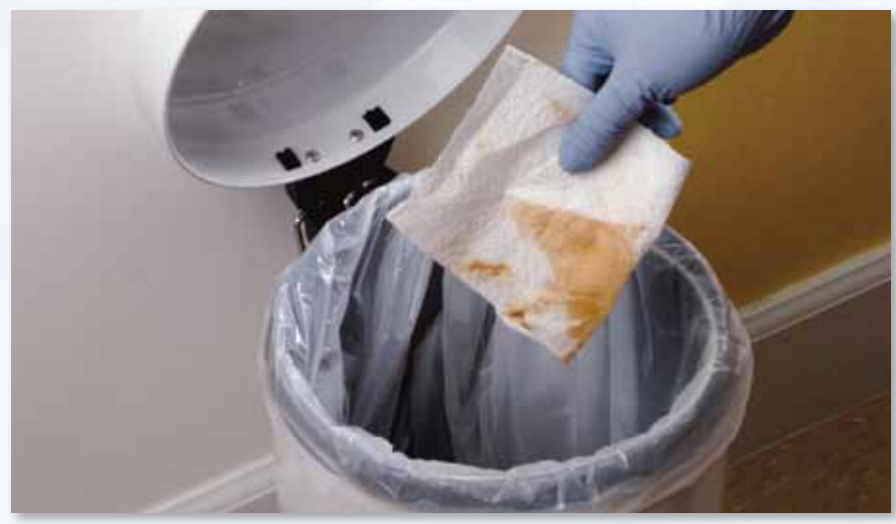
3. Discard towel.