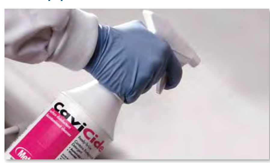
4. Spray CaviCide directly onto precleaned surface, thoroughly wetting area. Follow label instructions for appropriate contact times.